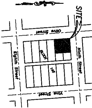
VICINITY MAP NO SCALE

BEING A DIVISION OF PORTIONS OF LOTS 11 & 12, BLOCK 146, (A/MB/169) CITY OF EL PASO DE ROBLES, COUNTY OF SAN LUIS OBISPO, STATE OF CALIFORNIA